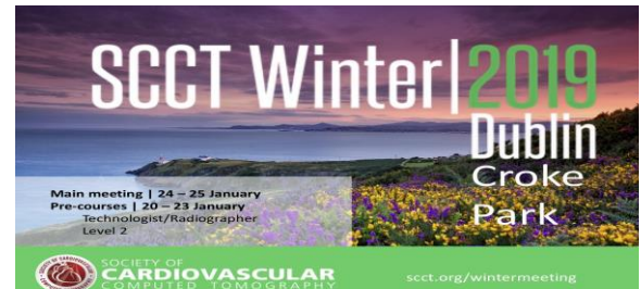
Image of the Month