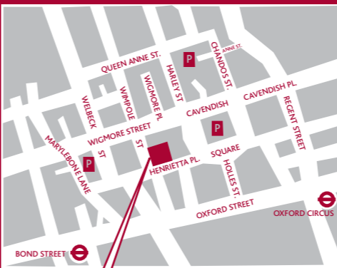
RSM AT 1 WIMPOLE STREET

Three car parks are situated close by in Cavendish Square, Chandos Street and Welbeck Street.